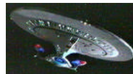
Concept of a Galaxy Class ship fitted with the XM-93 "Yamato".

The XM-93 (code named YAMATO 1 ) is actually a combination of two older technologies, namely Plasma and Lasers. This weapon was initially intended to be installed on a Galaxy Class starship but was not yet considered safe as far as hull integrity and plasma containment were concerned.